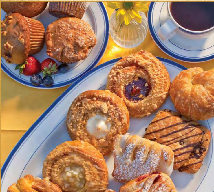
An assortment of petite croissants, danish, and muffins

Service for 6 to 8 people 19.95 Service for 50 to 60 people 89.95 Le Boulanger is proud to feature Peet's coffee. Our coffee service includes our regular and decaffeinated blends. Assorted herbal teas are available.