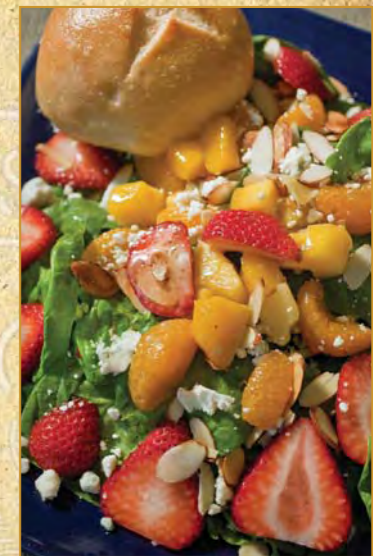
Sweet Strawberry, Mango & Spinach Salad

Serves 10 to 12 people Individual mini sandwiches served on dinner rolls. 69.99 (6.70 each additional person)